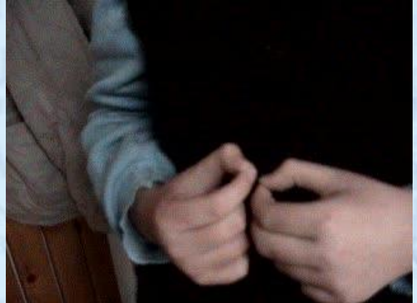
Concomitant: constant agitation of hands