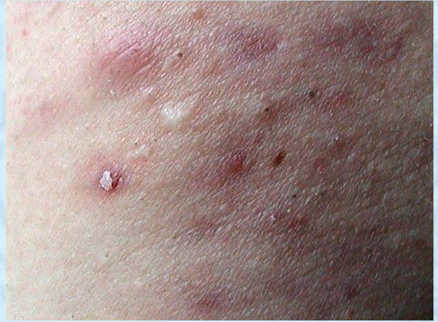
Micronodules and comedones