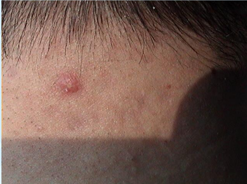
Pustule on edge of hair