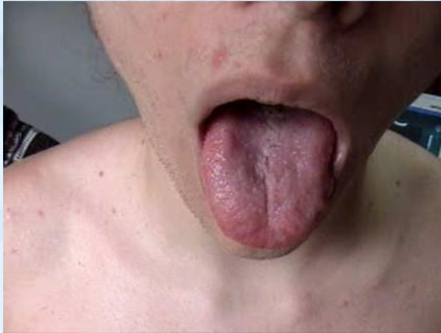
Asymmetry of medial line