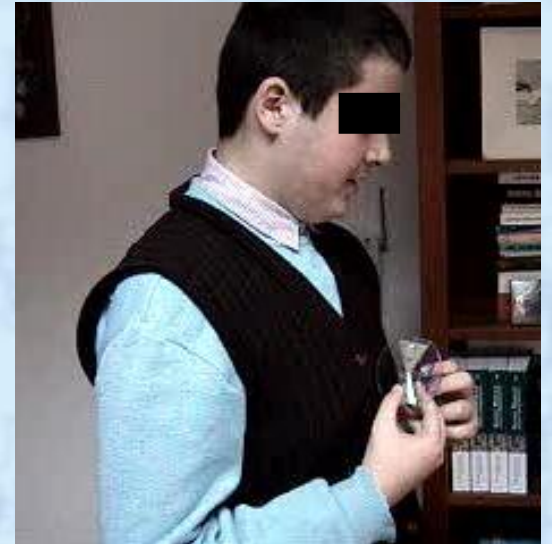
Compulsion to touch things